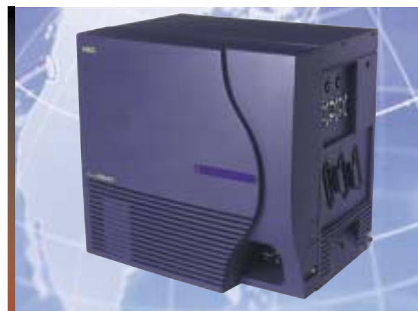
ELECTRA ELITE IPK The Electra Elite IPK is capable of expanding up to three modules