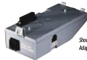
Shown: Analog Port Adapter w/o Ringer

*Keys may be programmed to support a variety of combinations. **Speed dial version has five dedicated function keys. Non-speed dial version has three. ***8 one-touch speed dial keys available. Note: Features may vary based upon system supported.